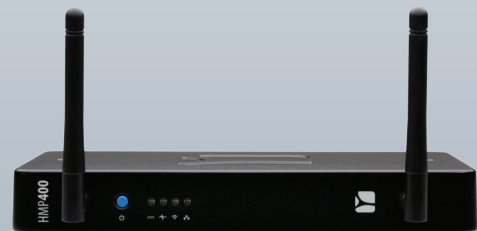
HMP400W with wifi